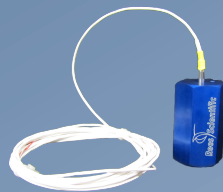
Temperature Block Air Vs. Block