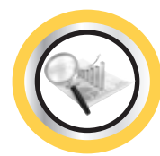
GRAPH OF EVENTS