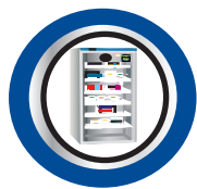
PROTECT VALUABLE ASSETS