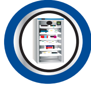
PROTECT CRITICAL EQUIPMENT