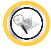
GRAPH OF EVENTS