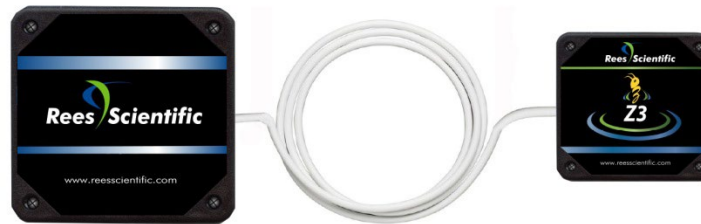
Expansion Modules with Output Relay and Z3 Wireless