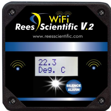
LCD display with alert and inhibit alarm button