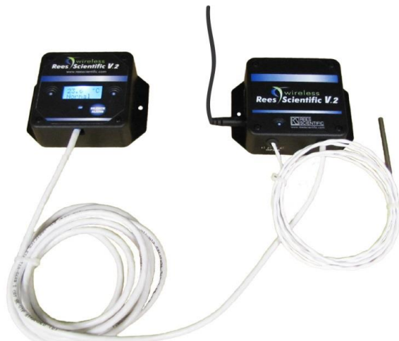
LCD wire extended modules

View sensor conditions of your unit right from the LCD display module. Many module families support the LCD displays. The displays can support one or two sensors and they can come equipped with a local audio and visual alert that can be silenced from the module with a push of a button. NOTE: the alert is designed to remind the user to close the refrigerator door. It is NOT documented and silencing it does NOT inhibit the Centron system alarm. If the out-of-range condition persists, a documented Centron system alarm will occur along with all of the usual alarm and dial-out options. This is done this way because a silence button provides no indication of who pressed it and inhibiting a real alarm with such a button would be a violation of good practices.