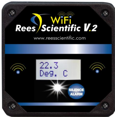
LCD display with alert and inhibit alarm button