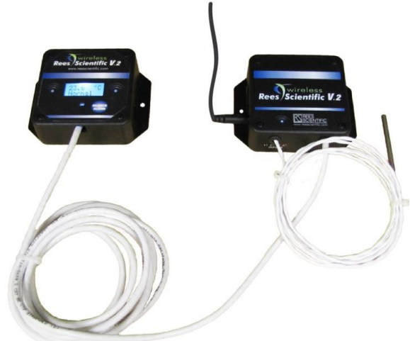
LCD wire extended modules

View sensor conditions of your unit right from the LCD display module. Many module families support the LCD displays. The displays can support one or two sensors and they can come equipped with a local audio and visual alert that can be silenced from the module with a push of a button. NOTE: the alert is designed to remind the user to close the refrigerator door. It is NOT documented and silencing it does NOT inhibit the Centron system alarm. If the out-of-range condition persists, a documented Centron system alarm will occur along with all of the usual alarm and dial-out options. This is done this way because a silence button provides no indication of who pressed it and inhibiting a real alarm with such a button would be a violation of good practices.