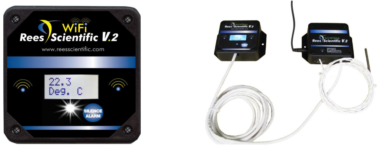
LCD display with alert and inhibit alarm button