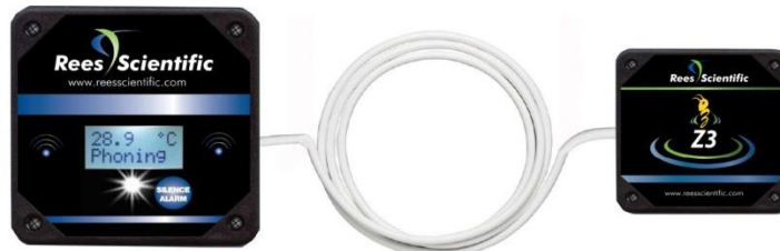
Expansion Modules with LCD and Z3 Wireless