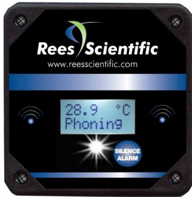
LCD display with alert and inhibit alarm button