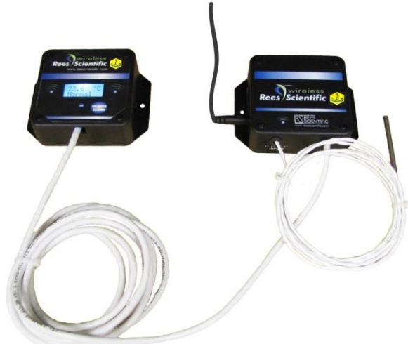
LCD expansion modules

View sensor conditions of your unit right from the LCD display module. Many module families support the LCD displays. The displays can support one or two sensors and they can come equipped with a local audio and visual alert that can be silenced from the module with a push of a button. NOTE: the alert is designed to remind the user to close the refrigerator door. It is NOT documented and silencing it does NOT inhibit the Centron system alarm. If the out-of-range condition persists, a documented Centron system alarm will occur along with all of the usual alarm and dial-out options. This is done this way because a silence button provides no indication of who pressed it and inhibiting a real alarm with such a button would be a violation of GxP and any other quality assurance based accountability requirement.