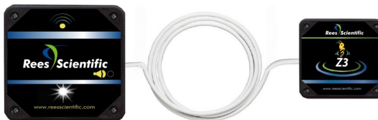
Expansion Modules with Z3 Wireless and Audio Visual Alarm