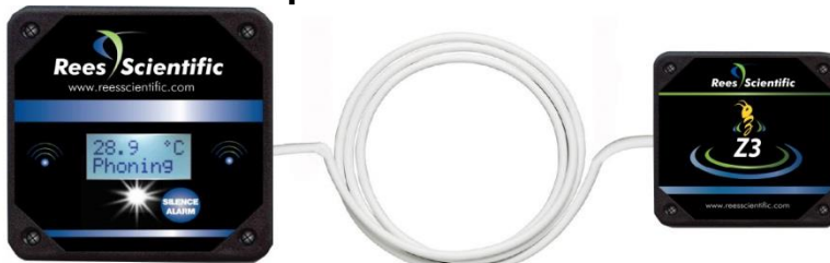
Expansion Modules with Z3 Wireless and LCD